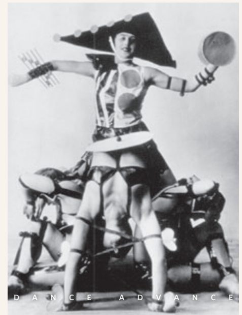
Exotisches (Exzentrisches) Orchester ; Vienna, 1926