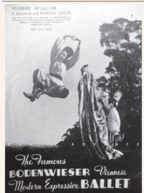
Poster art advertising New Zealand tour, 1947